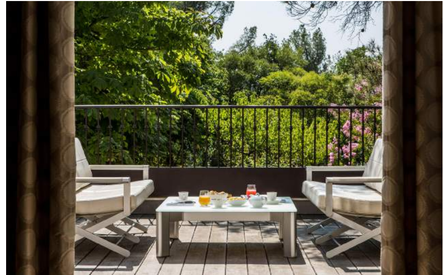
Private Terrace (60 m 2 /645 ft 2 )