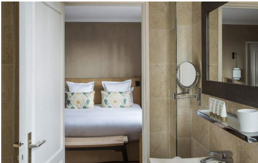
Superior (20-28 m 2 /215-300 ft 2 )