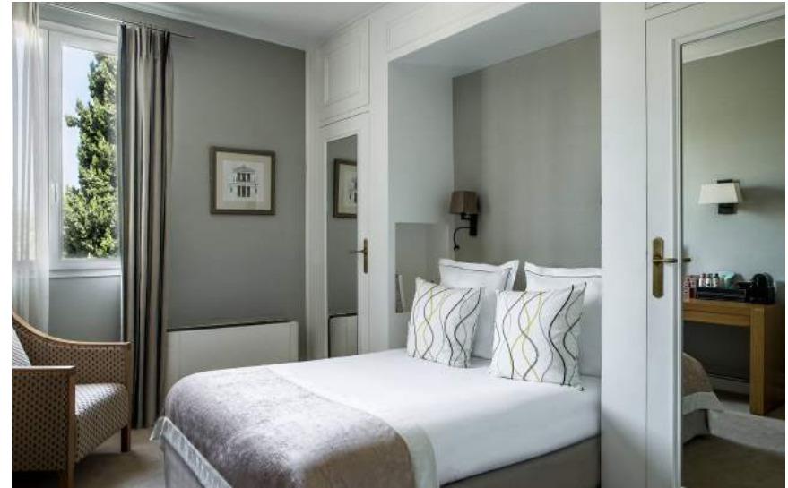
Classic (17-24 m 2 /182-258 ft 2 )