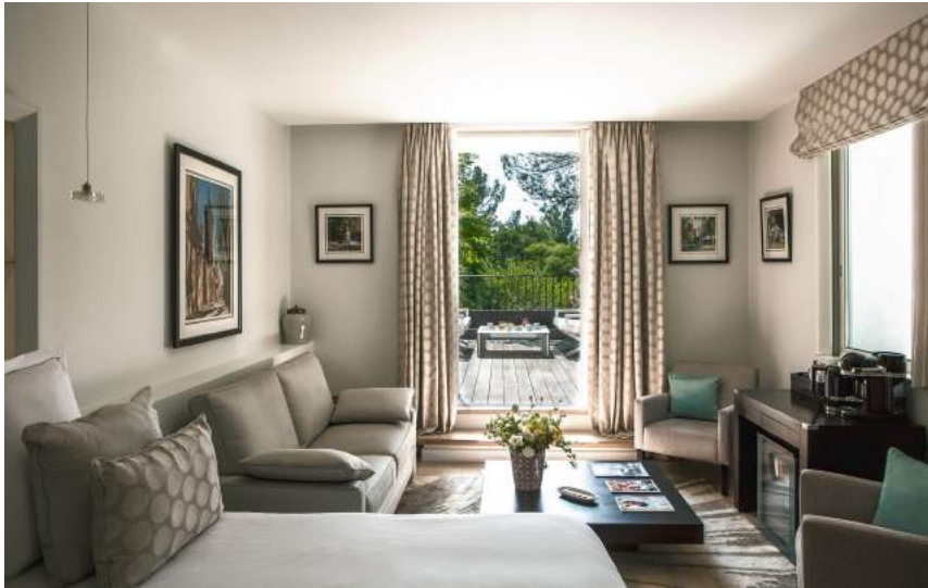
Junior Suite (36-45 m 2 /387-484 ft 2 )