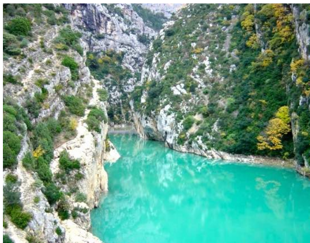
Gorges du Verdon