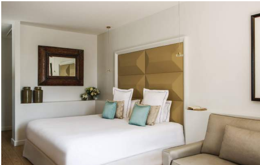
Junior Suite (36-45 m 2 /387-484 ft 2 )