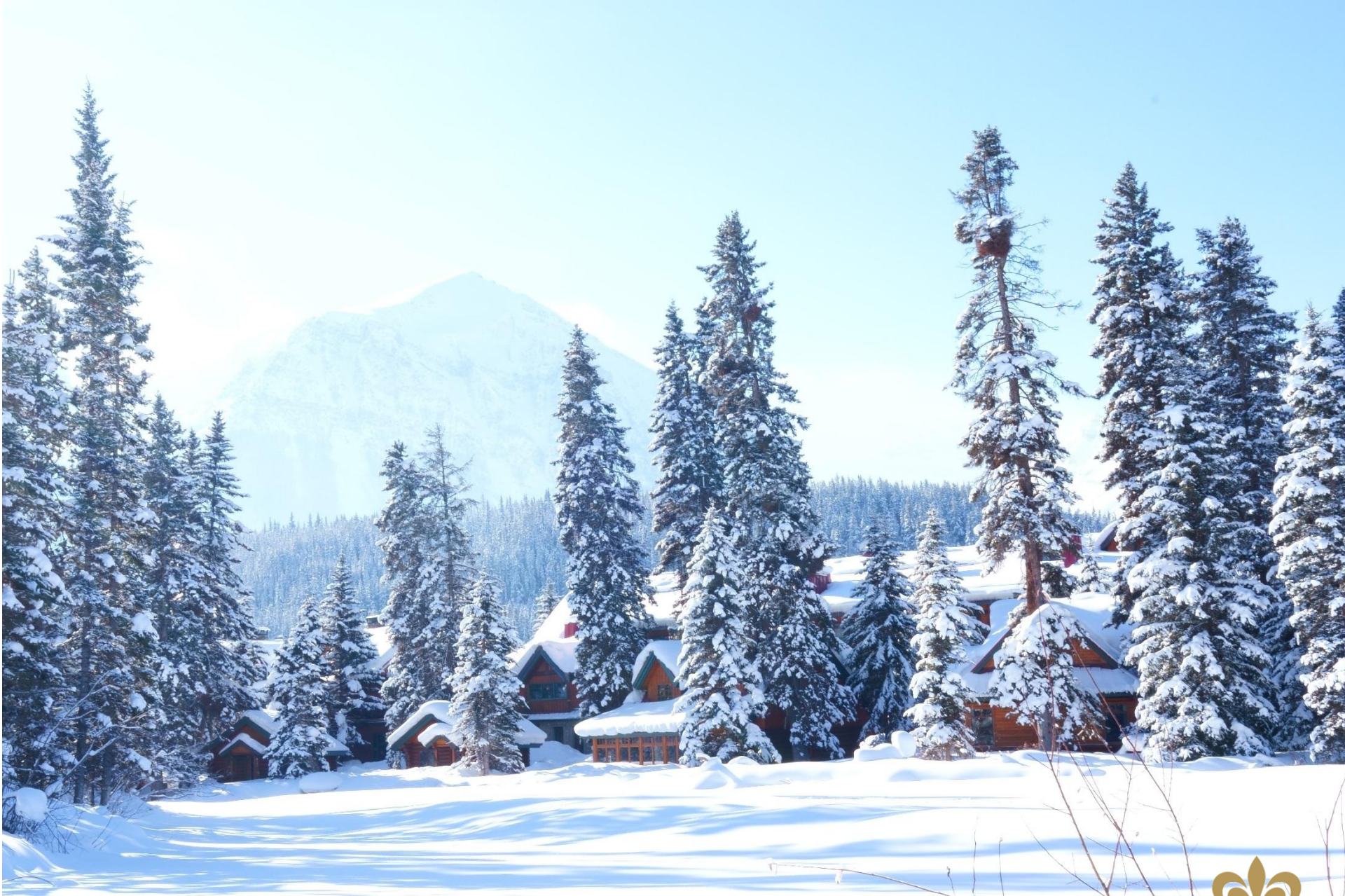
Post Hotel & Spa Lake Louise, Canada